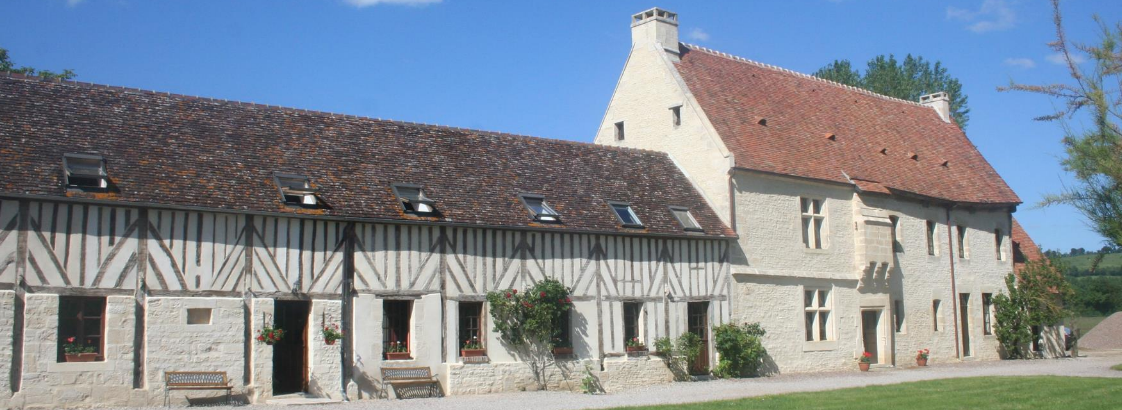
Le Haras de Guergué 61160 Omméel